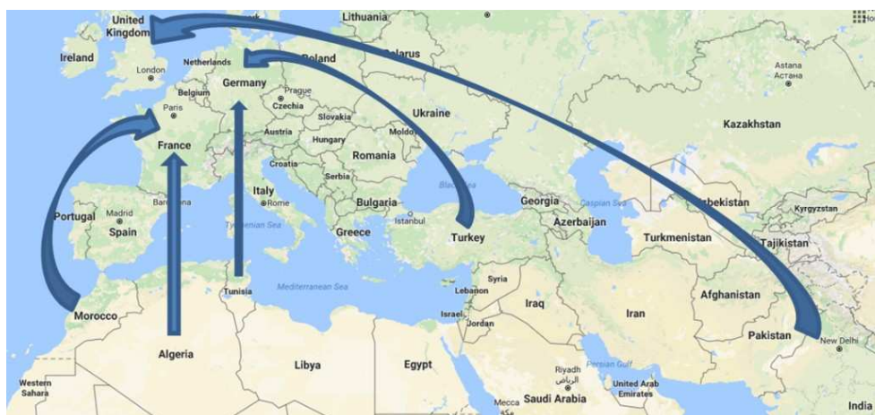
Fig. 1. The main flows of migrants, 1990s. [7]

million Moroccans, about 350 thousand immigrants from Tunisia. Currently in France there has been an influx of immigrants from Algeria, Morocco, Tunisia, Turkey and Senegal [1].